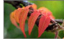
Add to the beauty of our community and enhance our heritage.

Civic minded citizens are working with the Marshfield Rotary Club and the Tree City Advisory Committee on behalf of the City. Some trees will be planted and in place readily available for the engraved granite brick to be permanently set. Also orders will be taken for more trees to plant. The cost of a larger tree with an 8 x 8" brick with up to six lines of engraving is $100. The cost of a smaller tree with a 4 x 8" brick with three lines of engraving is $50. You might be able to choose the tree species if that tree is available at the time the order is received by the Rotary Club.