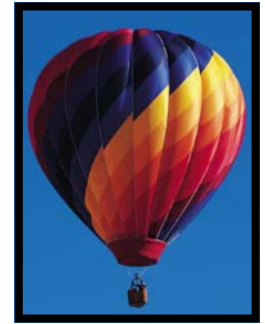
The Hot Air